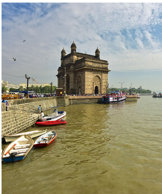
Gateway of India, Photo courtesy: Somnath Datta